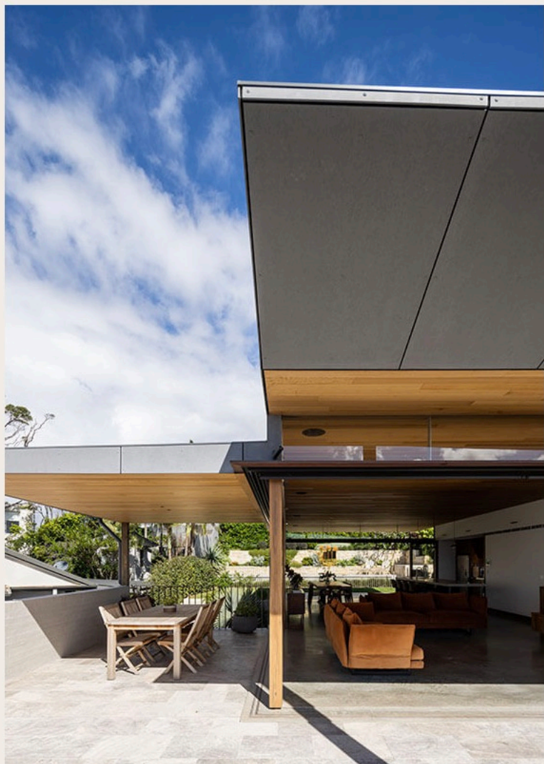
Platform House | Walknorth Architects